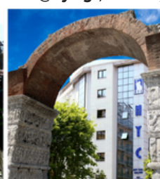
NYC THESSALONIKI CAMPUS ΘΕΣΣΑΛΟΝΙΚΗ