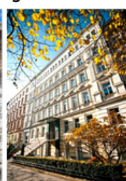
UNIVERSITY OF NEW YORK IN PRAGUE (UNYP) ΠΡΑΓΑ (ΤΣΕΧΙΑ)