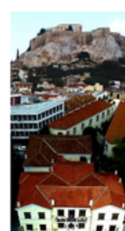
NYC ATHENS CAMPUS ΑΘΗΝΑ, ΣΥΝΤΑΓΜΑ

Apply Now- Info: NYC Athens Campus: 38 Amalias Ave., Syntagma tel.: +30 210 32 25 961 Thessaloniki: Egnatias & P.P. Germanou 138 tel: (+30) 231 132 0143 info@nyc.gr , www.nyc.gr