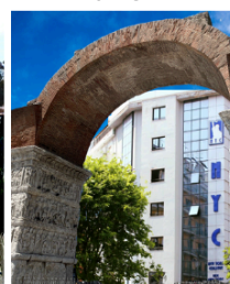
NYC THESSALONIKI CAMPUS ΘΕΣΣΑΛΟΝΙΚΗ