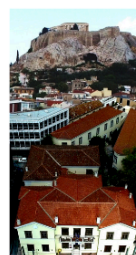
NYC ATHENS CAMPUS ATHENS, SYNTAGMA

Athens: 38 Amalias Ave., Syntagma tel.: +30 210 32 25 961 Thessaloniki: 138 Egnatias & P.P. Germanou tel.: +30 2310 88 98 79 info@nyc.gr, www.nyc.gr