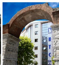
NYC THESSALONIKI CAMPUS THESSALONIKI