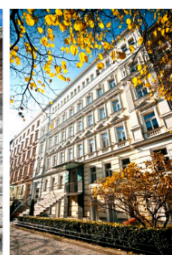
UNIVERSITY OF NEW YORK IN PRAGUE (UNYP) PRAGUE