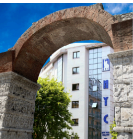
NYC THESSALONIKI CAMPUS ΘΕΣΣΑΛΟΝΙΚΗ