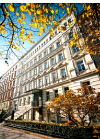
UNIVERSITY OF NEW YORK IN PRAGUE (UNYP) ΠΡΑΓΑ (ΤΣΕΧΙΑ)