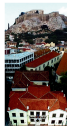
NYC ATHENS CAMPUS ATHENS, SYNTAGMA

Apply Now- Info: NYC Athens Campus: 38 Amalias Ave., Syntagma tel.: +30 210 32 25 961 Thessaloniki: Egnatias & P.P. Germanou 138 tel: (+30) 231 132 0143 info@nyc.gr, www.nyc.gr