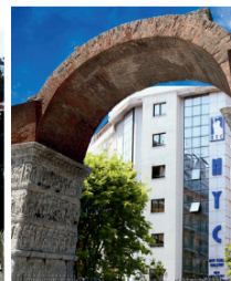
NYC THESSALONIKI CAMPUS THESSALONIKI