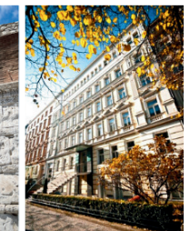
UNIVERSITY OF NEW YORK IN PRAGUE (UNYP) PRAGUE