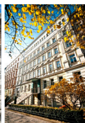
UNIVERSITY OF NEW YORK IN PRAGUE (UNYP) PRAGUE