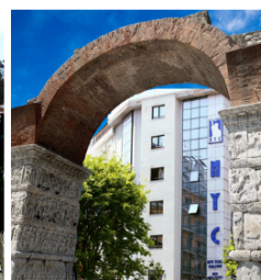
NYC THESSALONIKI CAMPUS THESSALONIKI