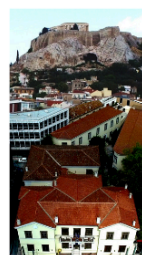
NYC ATHENS CAMPUS ATHENS, SYNTAGMA

Athens: 38 Amalias Ave., Syntagma tel.: +30 210 32 25 961 Thessaloniki: 138 Egnatias & P.P. Germanou tel.: +30 2310 88 98 79 info@nyc.gr, www.nyc.gr