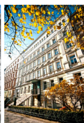
UNIVERSITY OF NEW YORK IN PRAGUE (UNYP) PRAGUE