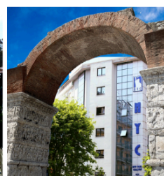
NYC THESSALONIKI CAMPUS THESSALONIKI