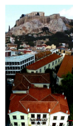
NYC ATHENS CAMPUS ATHENS, SYNTAGMA

Athens: 38 Amalias Ave., Syntagma tel.: +30 210 32 25 961 Thessaloniki: 138 Egnatias & P.P. Germanou tel.: +30 2310 88 98 79 info@nyc.gr, www.nyc.gr