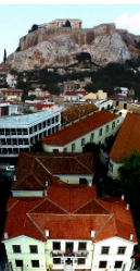
NYC ATHENS CAMPUS ATHENS, SYNTAGMA

Apply Now! Athens: 38 Amalias Ave., Syntagma tel.: +30 210 32 25 961 Thessaloniki: 138 Egnatias & P.P. Germanou tel.: +30 2310 88 98 79 info@nyc.gr, www.nyc.gr