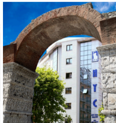
NYC THESSALONIKI CAMPUS THESSALONIKI