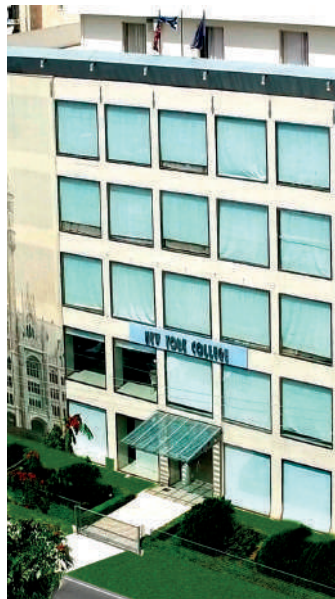
NYC PYTHAGORAS HALL ATHENS, KALLITHEA

38 Amalias Str., Syntagma Tel.: (0030) 2103225961 email: info@nyc.gr