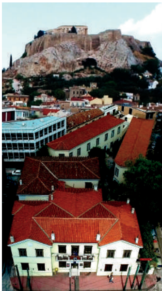
NYC ATHENS CAMPUS ATHENS, SYNTAGMA

The LEADING College of University Studies in Greece: The ONLY Greek College with expertise in founding and operating Private Universities in Europe!