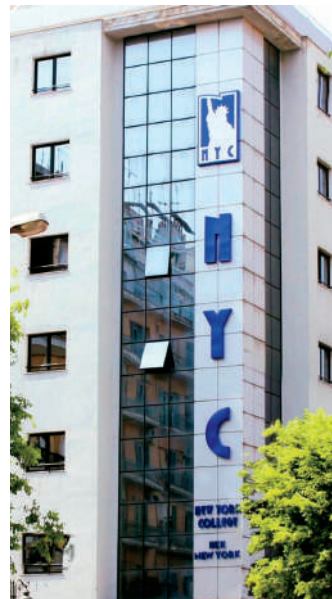
NYC THESSALONIKI CAMPUS THESSALONIKI

286 Thessalonikis Str., Kallithea Tel: (0030) 2104838071 email: info@nyc.gr