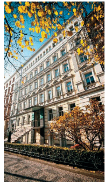
UNIVERSITY OF NEW YORK IN PRAGUE (UNYP) PRAGUE (CZECH REPUBLIC)

138 Egnatia and P.P. Germanou Str. Tel.: (0030) 2310889879 email: info@nyc.gr