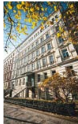
UNIVERSITY OF NEW YORK IN PRAGUE (UNYP) PRAGUE (CZECH REPUBLIC)

138 Egnatia and P.P. Germanou Str. Tel.: (0030) 2310889879 email: info@nyc.gr