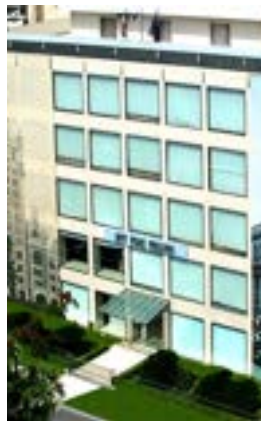
NYC PYTHAGORAS HALL ATHENS, KALLITHEA

38 Amalias Str., Syntagma Tel.: (0030) 2103225961 email: info@nyc.gr